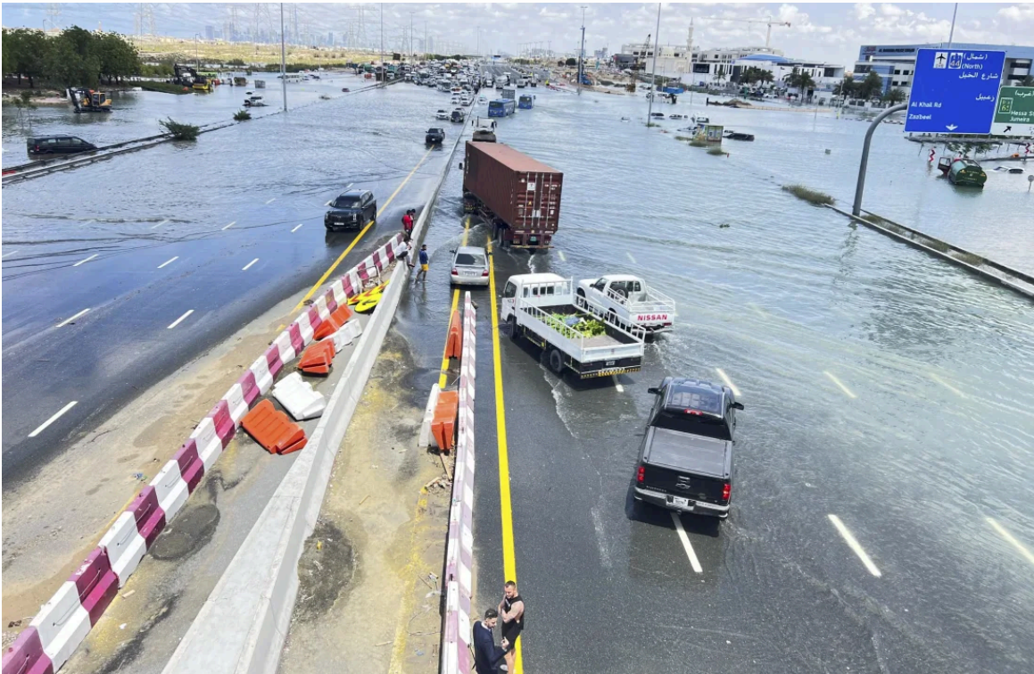
Source CNN : Vehicles, including cargo trucks, were stuck on a flooded road after a rainstorm hit Dubai, United Arab Emirates. Photo: Rula Rouhana/Reuters

Intra-country transportation was also affected, with many trucks being unable to transport containers from ports like Jebel Ali to the airport.