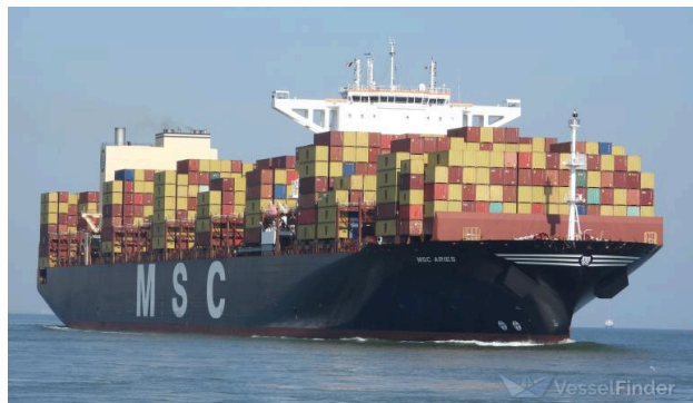
MSC Aries.

Tensions between Iran and Israel continue as The MSC Aries, a Portuguese-flagged vessel, was seized by Iran on April 13. Iran's foreign ministry stated the ship was violating maritime laws, adding they believed the vessel was linked to Israel. The vessel, carrying over 14,000 TEUs, was taken at the entrance of the Persian Gulf at the Strait of Hormuz. The vessel was moving on the HEX service, which operates between India and North Europe, with weekly rotation to Nhava Sheva and Mundra.