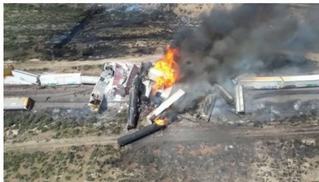
Source USA Today : A train derailed near Lupton, Arizona, near the New Mexico border on April 26, 2024. Photo source: Arizona Corporation Commission

A 35-car train derailed on April 26 at the Arizona-New Mexico border is under investigation. According to the Arizona Governor, as the train was carrying propane and gasoline, the accident was treated as a hazardous materials incident. Luckily, no injuries were sustained.