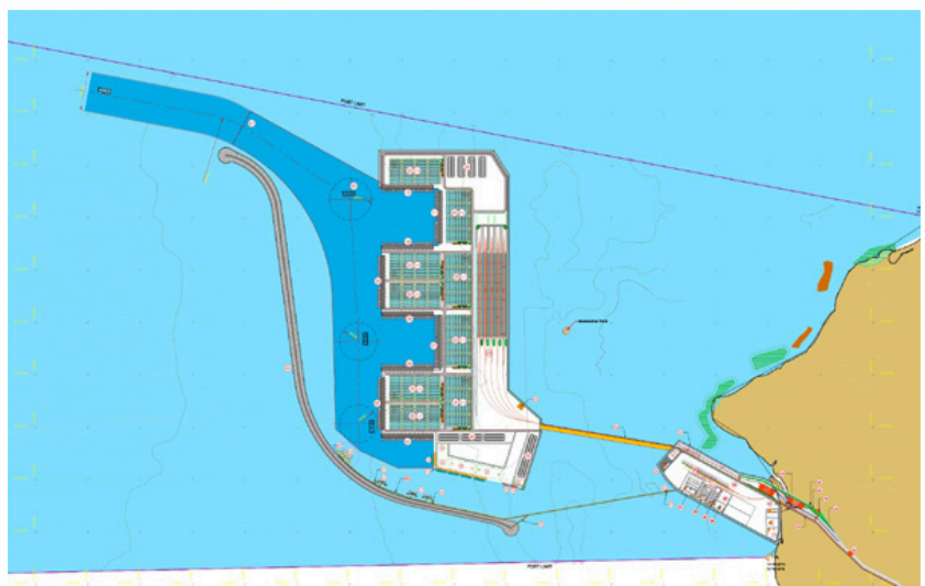
Site plan for the mega port JNPA.

The Indian Government has announced plans to develop a new port on the west coast, just north of Mumbai, with an estimated investment of $9.1 billion. The Vadhavan Port will be designed to enhance capacity, featuring nine terminals, four multipurpose berths, and an annual capacity to handle 300 million tons of cargo. This port is a key component of India's strategy to become an industrial powerhouse and will play a crucial role in facilitating trade between India, the Middle East, and Europe.