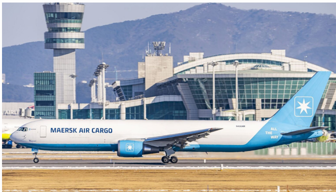
A Boeing 767-300 freighter operated by Amerijet for Maersk Air Cargo stops at Incheon airport in Seoul, South Korea, to load up with exports for the U.S. market.

Ocean carrier Maersk opened a 123,000-square-foot air freight station in Atlanta to help support quicker international shipping for customers. The location will also serve as a staging point for Maersk's dedicated freighter hub at Greenville-Spartanburg International Airport. The new gateway is two miles from Atlanta in the Tradeport Foreign Trade Zone, which offers reduced processing fees and duties and access to two major interstates for quicker delivery times.