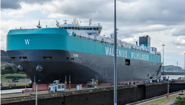
A ship enters the Miraflores Locks on February 3, 2024. Due to higher water levels in Gatun Lake, the Panama Canal will increase daily booking slots to 27 starting March 25.

Maersk has already notified customers with import cargo destined for New York, Newark, and Norfolk to arrange for the pick-up of containers as quickly as possible to help with the overflow.